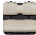
Champagne Seats (stitched or smooth)