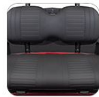
Black Seats (stitched or smooth)