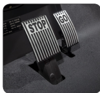
Electro-Magnetic Parking Brake