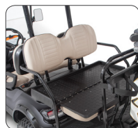
Rear Fully Foldable Seat (Flatbed)

Additional Base Model Features include: Off-Road tyres, fender flares, LED headlights & taillights, dual USB charging ports, non-universal key switch, premium steering wheel, hooter, battery level indicator, extended roof canopy, reverse buzzer.