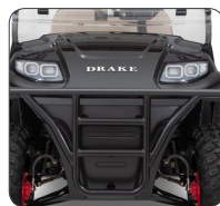
Front Nudge Bar