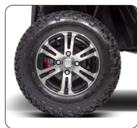
12" Alloy Rims