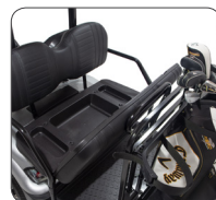
Rear Storage Compartment

Additional Base Model Features include: Dual USB charging ports, non-universal key switch, premium steering wheel, hooter, battery level indicator, extended roof canopy, reverse buzzer.