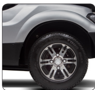
10" Alloy Rims