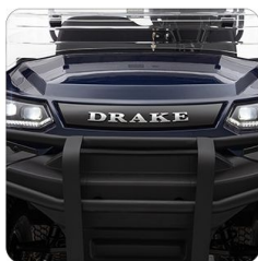
Front Nudge Bar