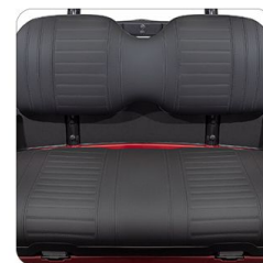
Black Seats (stitched or smooth)

Additional Base Model Features include: LED Headlights + Taillights - Flickers - Warning Lights - Front Bull Bar - Fender Flares - Speedometer - Dual USB Charging Ports - Non-Universal Key Switch - Premium Steering Wheel - Corrugated Aluminium Floor - Hooter - Battery Level Indicator - Extended Roof Canopy - Reverse Buzzer - Fully Foldable Rear Seat - 12" Super Turf Tyres and Rims