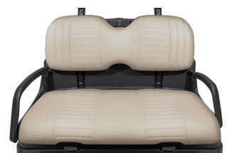
Beige Seats (Stitched or Smooth)