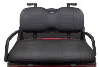
Black Seats (Stitched or Smooth)