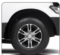
10" Alloy Rims